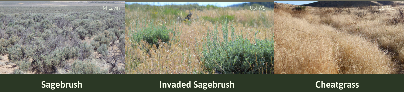
Figure 3 (above): Transition from Wyoming big sagebrush ( Artemisia tridentata subsp. wyomingensis ) to cheatgrass. Some subspecies of Artemisia tridentata like Wyoming big sagebrush have limited regeneration post-fire as cheatgrass depletes soil moisture.

Unlike the more arid areas to the west, invasion of annual grasses in the Great Plains may not perpetuate a grass-fire cycle where grasses are already dominant; here fire may have either neutral or negative effects on invasive grasses.